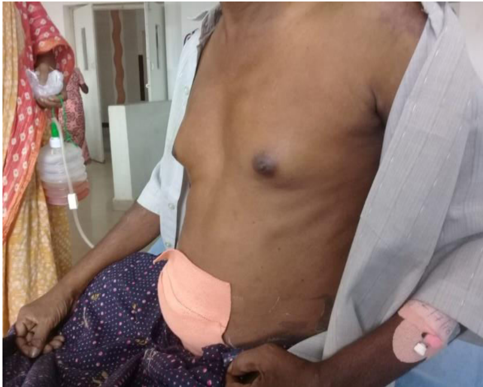
Figure 2: Lateral view of the patient showing Gynaecomastia