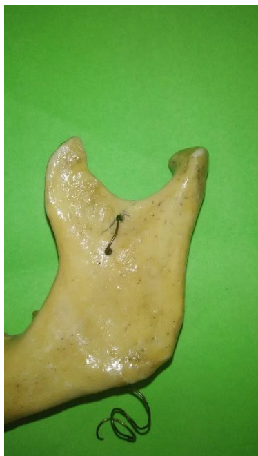
2. Hook Shaped