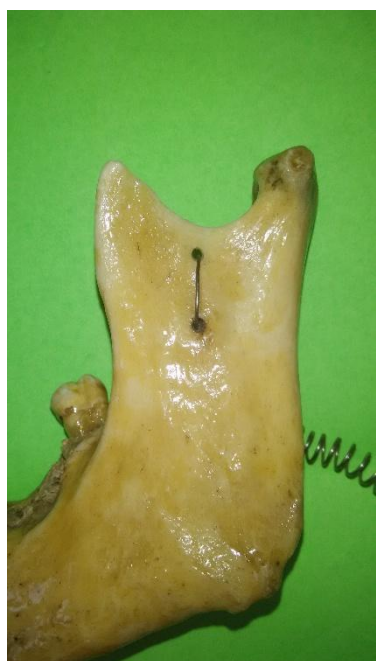
1. Triangular Shaped

and 80 female) coronoid process triangle are recorded in Table – II .