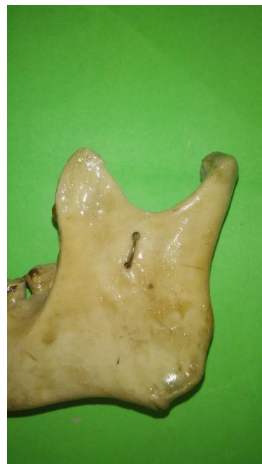
3. Rounded Shaped

Total Number of Coronoid Processes Studied = 200