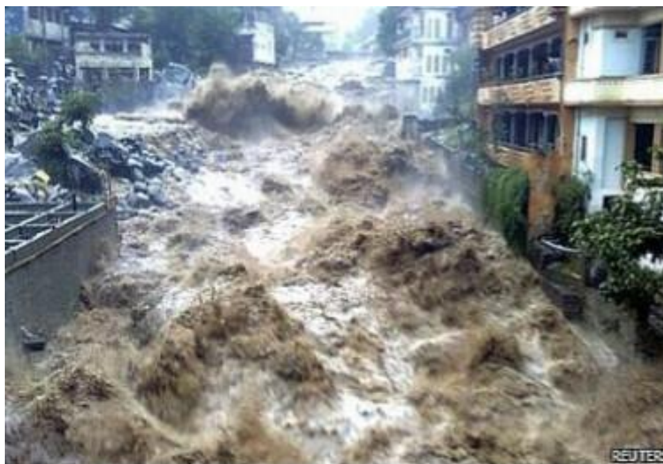
Figure – II: showed gushing water in Swat Valley

Roughly one-fifth of Pakistan's absolute land zone stayed submerged due to the flooding [11]. Diarrheal illnesses, hepatitis, measles, meningitis, intense respiratory contamination and jungle fever have been normally depicted after catastrophic events and struggle circumstances. Tularemia, Lassa fever, the pneumonic plague was chiefly portrayed after the clash. Different sicknesses including diphtheria, flu and pertussis have been less recorded in calamity and evacuee settings, however, can possibly spread quickly in packed situations [12]. This examination had been led to assess the ailments predominant among the flood-affected people, so genuine insights could be gotten. It is normal that it would be useful in anticipating decrease and end of these irresistible illnesses.