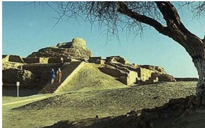
Figure – I: Mohenjo-Daro cradle of Indus civilization: One of the reasons for its destruction was a massive flood in 1700 BC

As the flood waters retreated, the peril of disease among the flood exploited people rose. The camps where individuals took cover turned into a potential reproducing ground for jungle fever, cholera, and other gastrointestinal ailments. The vast majority in