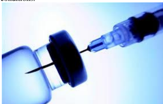
Fig 1: vaccine

A vaccine is a biological preparation that provides active acquired immunity to a particular disease. If proved safe and cost effective, a vaccine can protect people from diseases and its heavy economic burden. Immunotherapy products are now been developed for every major therapeutic category from anti-infective to autoimmune disorders, oncology, cardiovascular or neurological conditions.