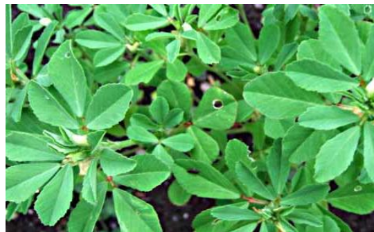
Fig1: Trigonella foenum graecum L.

Kingdom: Plantae Division: Phenarogames Class: Dicotyledons S. class: Polypetalae Order: Rosales Family: Fabaceae Genus: Trigonella Species: foenum-graecum