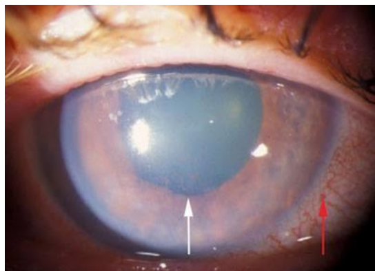
Figure 2: Intravitreal transplantation of OPCs did not affect intraocular pressure changes following ocular hypertension induction.