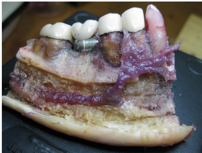
Figure 2. The preparation of the mandible after 7 years of storage in dry form

(glycerin). The drugs observed by us for 5 years retain their color and do not undergo disintegration. Evaluation of the results of the introduction of the storage method allowed adding a modification in the form of storage conditions (Figure 2).