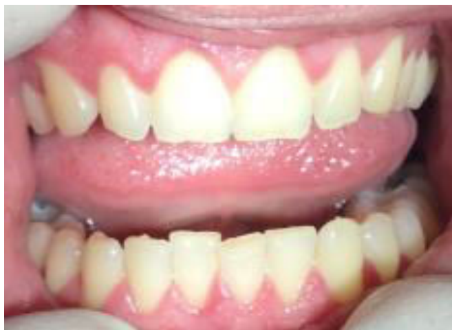
Fig 2: Patient D., gingivitis on the background of xerostomia.

It is known that the lactoperoxidase system (LPO) has a pronounced antibacterial activity against both gram-positive and gram-negative bacteria. It was shown that the growth of colonies Staphylococcus aureus , Streptococcus , E. coli , Pseudomonasaeruginosa , Burkholderiacepacia and Haemophilusinfluenza was inhibited by the LPO system. According to Abaturova A.E. (2009), the functioning of the LPO system can be accompanied by a bactericidal effect, which is due to the production of activated oxygen-containing metabolites that cause irreversible oxidation of bacterial membranes proteins. The LPO system also provides antifungal (Dovydenko AB, Sampiev AT, 2009) and antiviral protection. In the studies of A.Dovydenko. (2008) demonstrated a concomitant reduction in peroxidase and \alpha -amylase against a background of mild to moderate xerostomia (7-9).