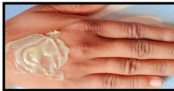
Figure 03:- Greasiness test

Here the cream was applied on the skin surface in the form of smear and checked if the smear was oily or grease-like.