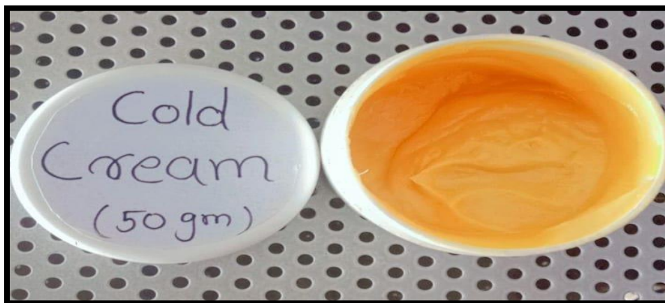
Figure 01:- Cold Cream Preparation