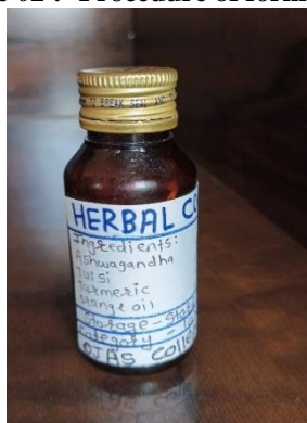
Figure 03:-Final cough syrup formulation