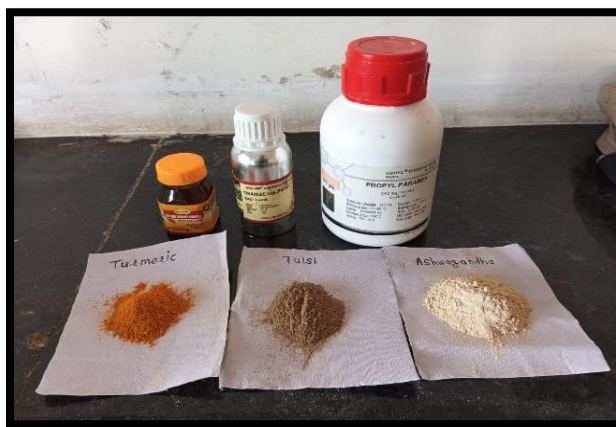
Figure 01 :- Ingredients used in formulation

All the natural materials used in the present study i.e; Ashwagandha, Tulsi Turmeric, Orange oil , and Honey were purchased from local market, Whereas some are in college laboratory The details of the plant material used for the formulation of Herbal cough syrup are mentioned below: