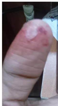
After use smut powder